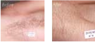
Hair reduction - underarm area

These are good indications that sufficient heating of the follicles has taken place. Unfortunately, this is not always seen and many clients and successful treatment results will occur without the post treatment signs.