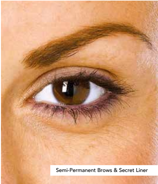
Semi-Permanent Brows & Secret Liner