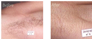
Hair reduction - underarm area

These are good indications that sufficient heating of the follicles has taken place. Unfortunately, this is not always seen and many clients and successful treatment results will occur without the post treatment signs.